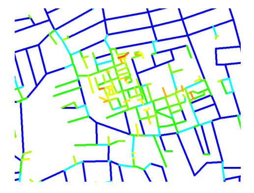
C Analysis of over-complex, under-used spaces Post-war estates are typified by having overlycomplex spatial layouts. This means that many spaces in them are under-used by everyday activity.

D Rioting/looting "catchment" analysis Extract from the north London study area, showing streets (blue) that are within 400m of both town centres and large post-war housing estates (black).