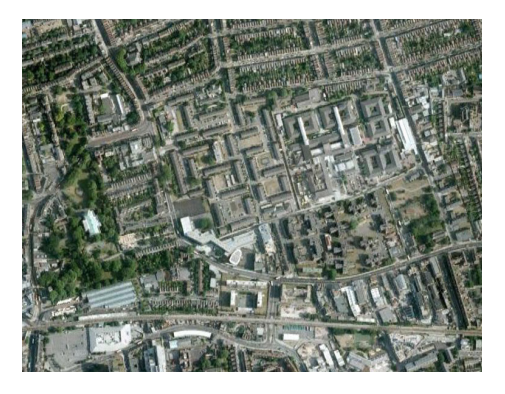
B Large post-war housing estate in Hackney